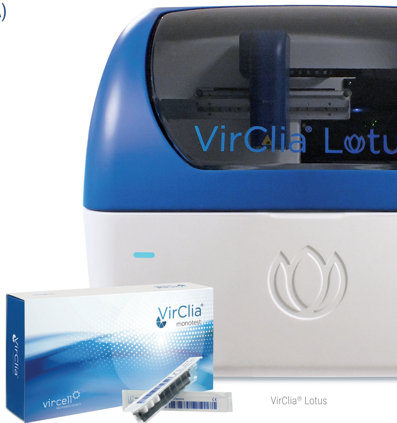
VirClia® MONOTEST - 24 tests